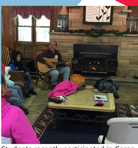
Students recently participated in Camp Buckeye's outdoor education event, complete with sing-a-longs around the fire!